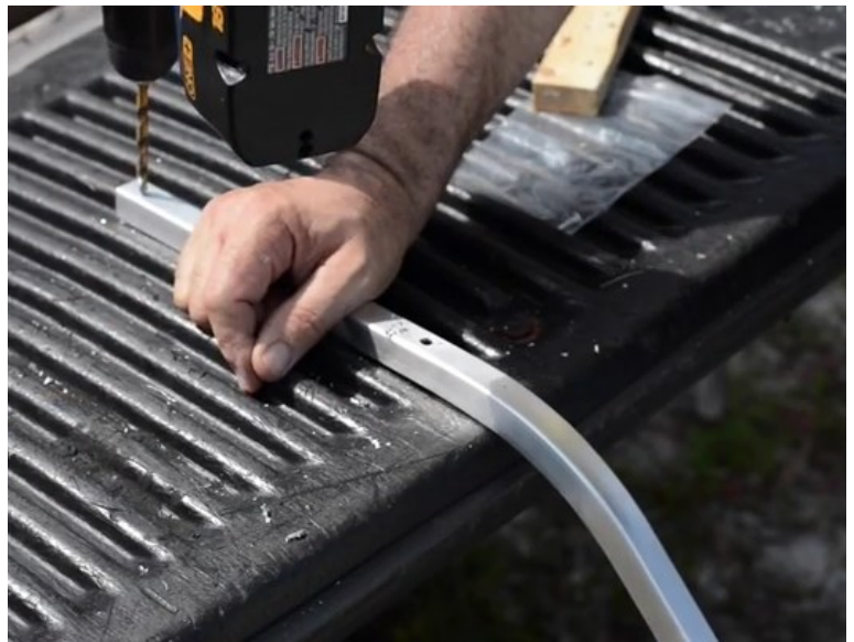
Drill holes for attaching bracket to post.