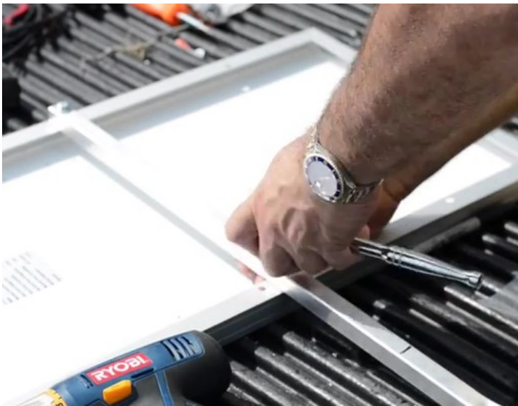
Attach bracket to back of solar panel.

Note: Respect polarity when attaching the wire to the solar panel. Crimp the wires then secure them into the terminals. See Fig 1.